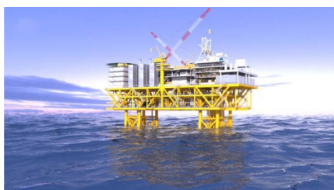
Visualization of a platform in CNOOC's Dongfang 13-2 gas field

The South China Sea is home to vast reserves of crude oil and natural gas. CNOOC Ltd. has initiated a further development stage of the Dongfang natural gas field. Additional gas exploitation in the area is part of the country's long-term goal to satisfy its growing energy consumption.